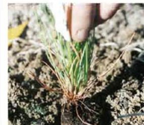
Left: When hand-planting containerized longleaf pine, it is best to keep the plug slightly exposed.