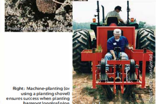
Right: Machine-planting (or using a planting shovel) ensures success when planting bareroot longleaf pine.