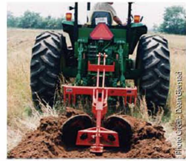
Scalping along the contour of the land reduces erosion and is a successful treatment to prepare agricultural fields and pastures for planting longleaf pine.