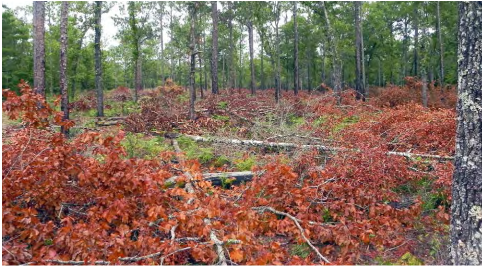
After the brush clearing

plants on the property she learned from members of the Florida Native Plant Society. She labels plants as people identify them so she is able to observe them throughout the seasons. This is a great way to learn how to identify plants whether in flower or not. Her philosophy has been that you need to learn the plants on your property so you know which ones are most vulnerable and need protection and which ones are invasive and need to be removed to protect the native habitat. She encourages other landowners to get involved with their