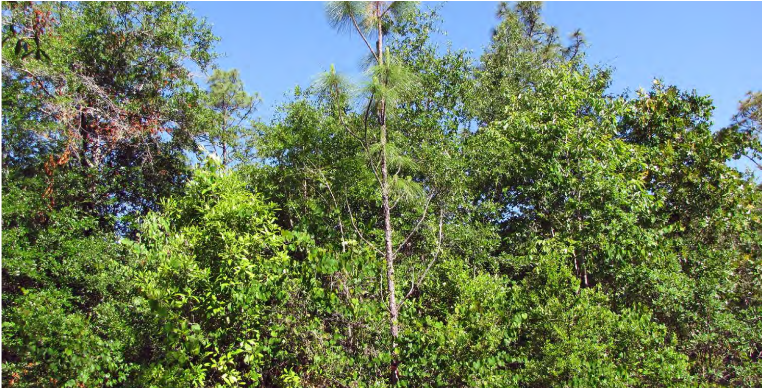
Before the brush clearing project