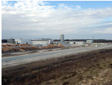
Klausner Lumber One Sawmill in Suwannee County.

One of the largest and most productive softwood timber manufacturers in Europe, Klausner produces approximately 1.3 billion board feet of sawn lumber annually and exports products across the globe. The Klausner Lumber One mill is the largest and most technologically advanced sawmill now operating in the Southeastern U.S.