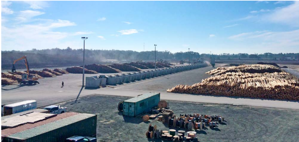
Klausner Lumber One wood yard.

rotations, maximizing the growth potential of their timber stands and the return on their timber investment.