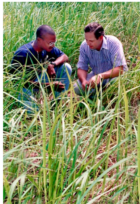
The economic impacts of cogongrass infestations to forest landowners, the forest industry and related business sectors are significant.