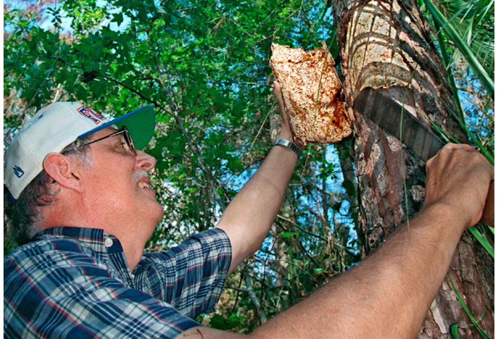
Professional foresters offer many services, such as helping diagnose forest health issues.

I do not know if I have ever met a practicing professional forester that has expressed the thought, "I wish I had chosen a career in a different field other than forestry". The nature of forestry work varies widely by employer and position, though most positions require an interesting blend of biological and social sciences and often economic/business skills. If you know a young man or woman desiring to become a professional forester, where would they start? My recommendation is to obtain an AS degree and find a university with a SAF Accredited forestry program. In Florida, the University of Florida School of Forest Resources and Conservation (SFRC) has multiple SAF Accredited forestry programs with diverse specializations including Forest Resource Management, Urban Forestry, Business Management, Protected Areas Management, and Recreational Resources Management. Still other non-accredited forestry and natural resource programs exist at SFRC, and if looking at a career outside of forestry, programs are available in Fisheries and Aquatic