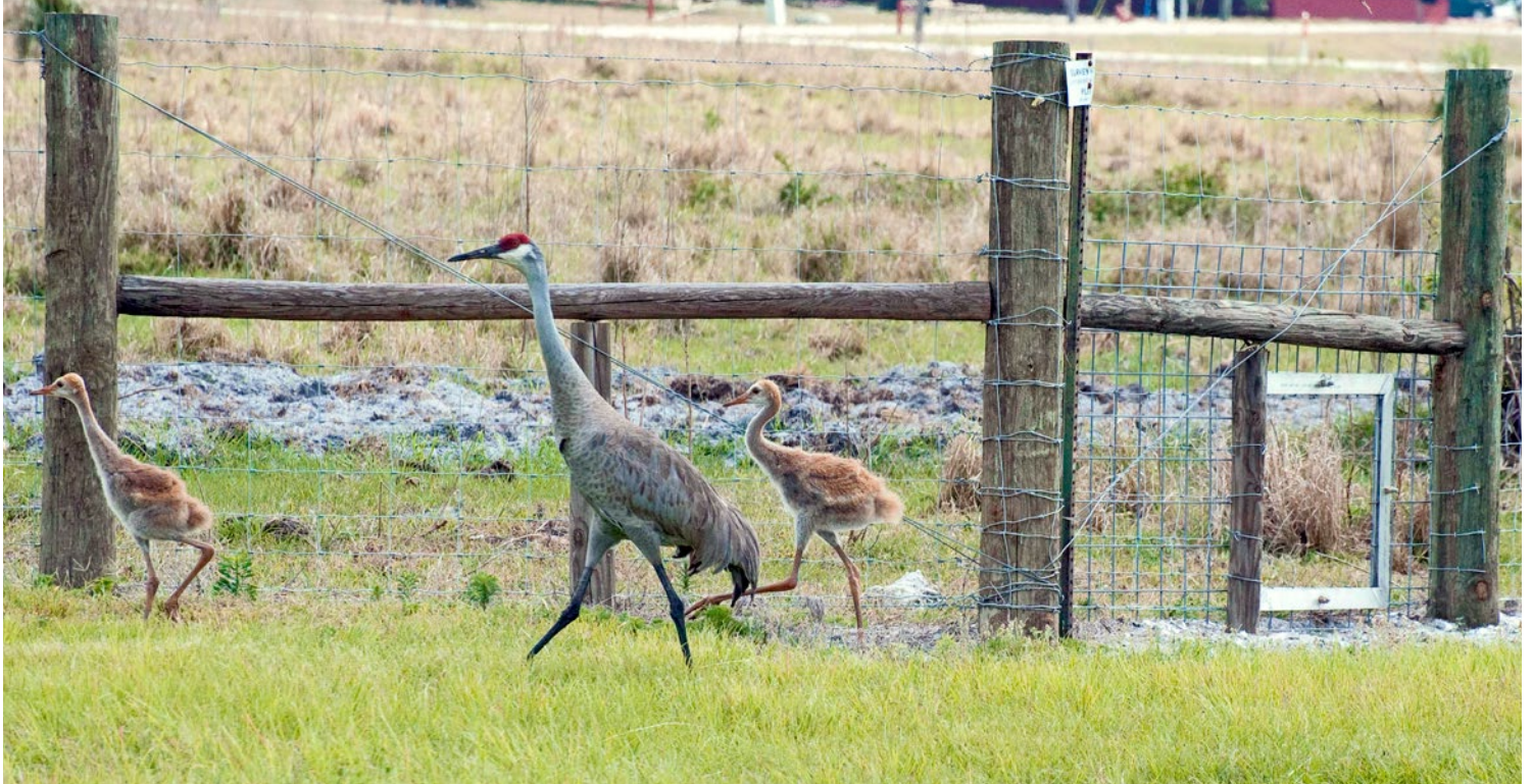
Fences can be modified with a small walk-through frame to allow birds, like Florida sandhill cranes, to travel across the landscape.

Specialist for use in Florida: https://efotg.sc.egov.usda.gov/references/public/FL/FL_382_BW.pdf