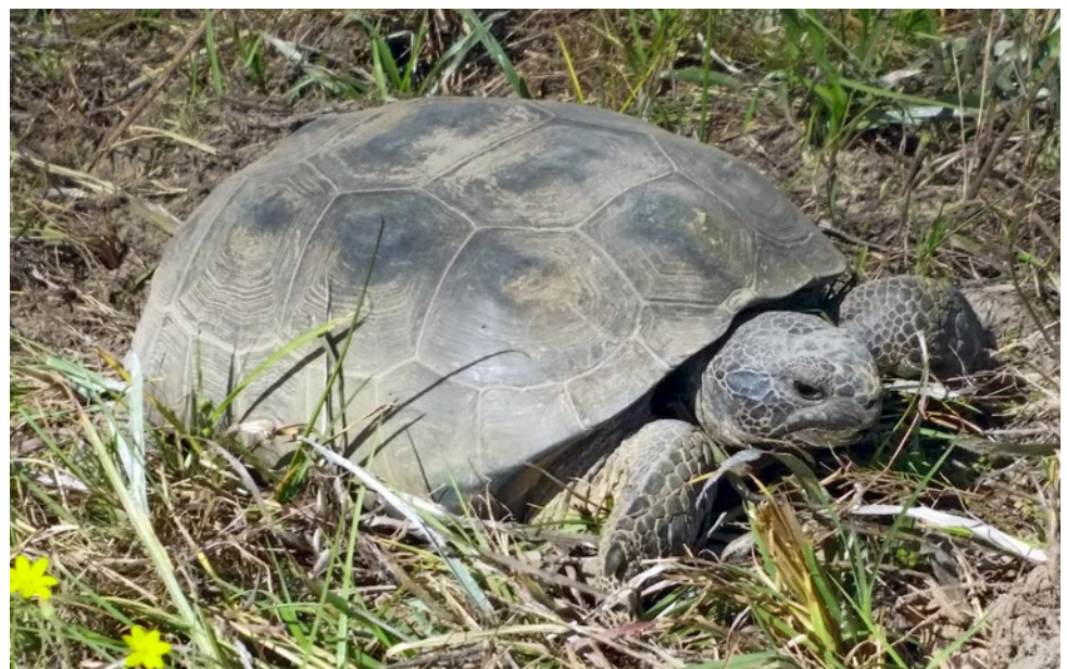
Forestry Rule 51-8 addresses 16 State Imperiled Species, like the gopher tortoise, which are considered to be potentially vulnerable to silviculture operations.