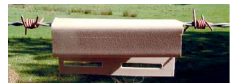
Fence tags like this can help increase the visibility of fences for wildlife.

Erecting or modifying existing fences so that they are wildlife friendly will save countless numbers of animals that evolved in the wide open expanses of prairies, savannahs, and wetlands of our state. For more information on wildlife friendly fencing or other wildlife related technical assistance, please contact the FWC Landowner Assistance Coordinator serving your area at http://www.myfwc.com/conservation/special-initiatives/lap/contact-us/