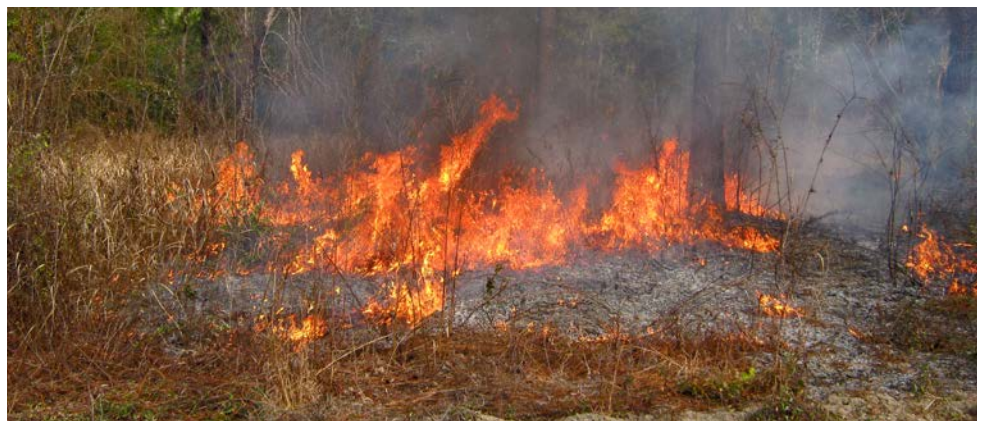
Cogongrass burning hot under a pine stand.

If you need financial assistance to treat your cogongrass, the Natural Resources Conservation Service (NRCS) has a program that can help defray some of the costs. Contact your local NRCS District Conservationist and ask about the Environmental Quality Incentives Program. To learn more about managing wildlife and habitat on your property, check out our habitat how-to section at the FWC's Landowner Assistance Program by going to MyFWC.com/LAP . You can also contact a LAP regional biologist for technical assistance. For more information on how to identify and treat cogongrass go to http://plants.ifas.ufl.edu/plant-directory/imperata-cylindrica/ .