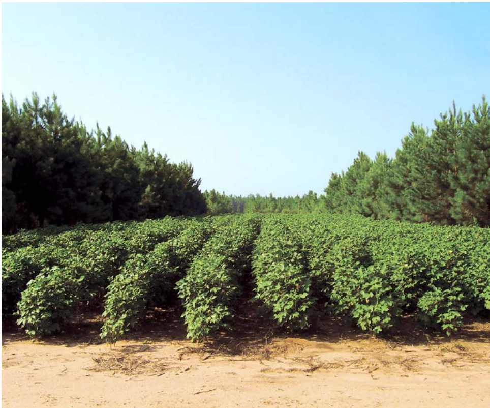
Alley cropping