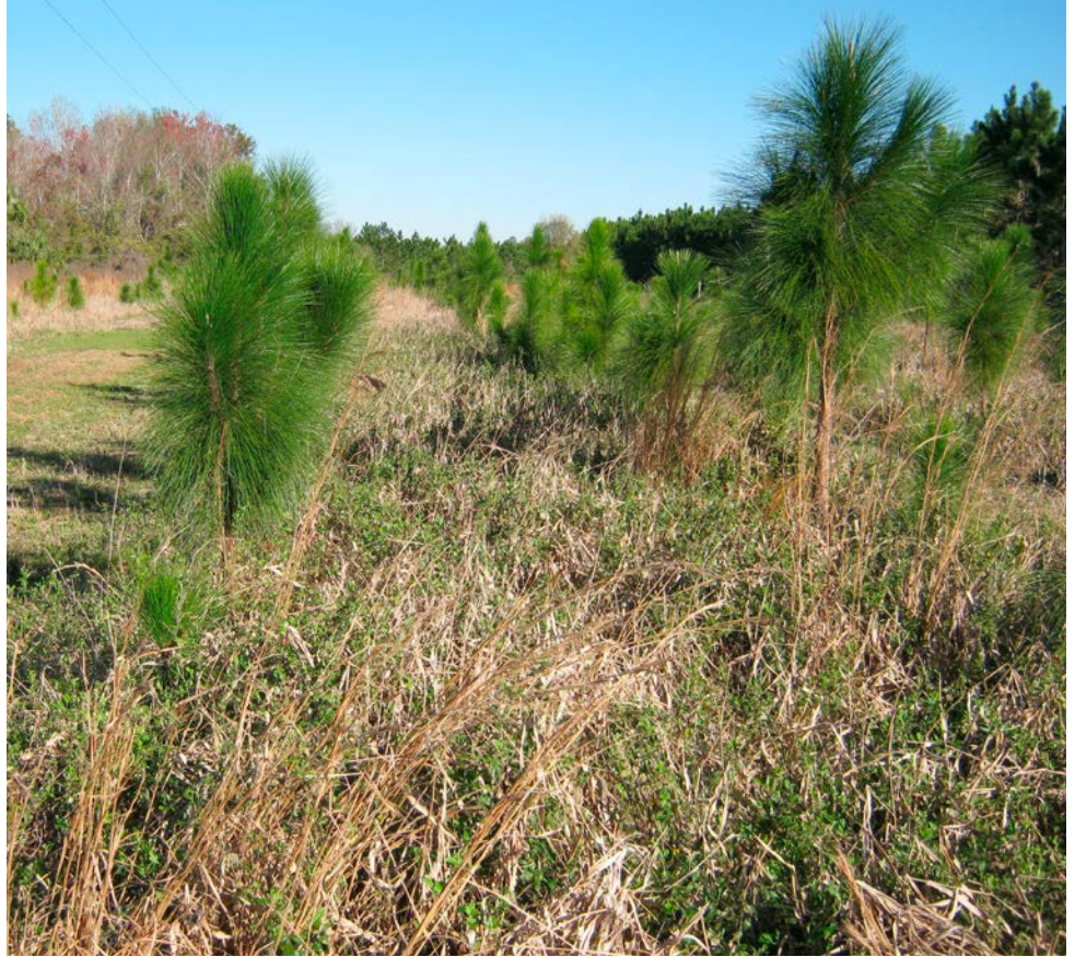
Longleaf pine is adapted to fire at a young age and is a good choice for landowners with wildlife habitat objectives.

Finally, we conclude with the perspective of forest resiliency. Native trees and forests have proven over time to be very resilient. Let's consider two similar disasters in the past: Hurricane Hugo (South Carolina, 1989) and Hurricane Katrina (Louisiana and Mississippi, 2005). Both hurricanes each impacted several million acres of timberlands. Today, however, timber is the leading cash crop in South Carolina and