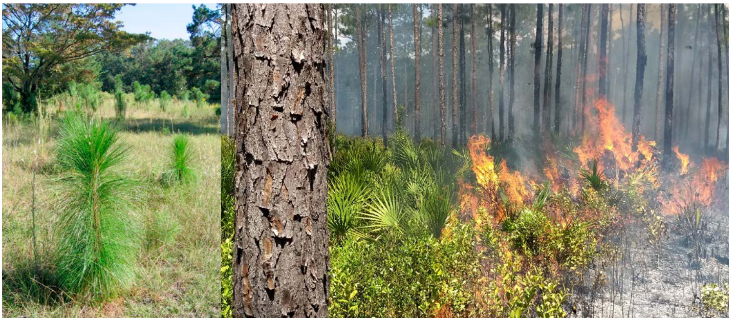
(Right) Longleaf pine in the bottle brush stage. (Left) The thick, flaky bark of longleaf pine is an important part of its adaptation to frequent fire.