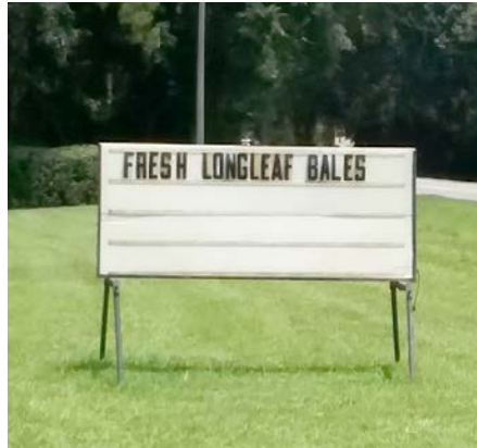
Longleaf pine straw for sale.

When seedlings begin to initiate height growth, they have a very foreign look that attracts immediate attention, this unusual appearance is often described as bottle brush. As the trees continue to mature, they put out branches to form a more normal looking tree. Longleaf pines can get quite large, 80 to 100 feet tall is not uncommon. Their lifespan can extend to 300-400 years. Although not as long as its common companion wiregrass, which has been found to live up to 600 years. The old trees have tall, straight trunks with open irregular crowns, one-third the length of the tree. Longleaf pine self-prunes well and produced good quality lumber. While not immune to disease, longleaf is less susceptible to a fungus called fusiform rust that is very common on the trunks of slash and loblolly pines. Longleaf pine is attacked by pine beetles as are other pines in our area, but it's very sappy nature helps it resist the pine beetles better.