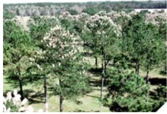
Figure 2. Seed orchard photo showing bags that exclude outside pollen sources (right). Eventually the bags will decompose, allowing the mass control pollinated cones to mature.

Varietal pine is the top genetic level of pine tree improvement today. The term varietal was given to the development of pine clones (Rousseau 2010). Varietal pine seedlings are produced through either hedging or somatic embryogenesis. Hedging is a simple technique where young seedlings are cut back to produce numerous growing tips that are harvested and propagated into seedlings. Somatic embryogenesis is a technique where an embryo is removed from the seed and placed into a system that allows it to multiply. These embryos are grown on a specialized media to form seedlings that are identical copies of the original. In this process it is possible to place the resulting embryos in liquid nitrogen (cryopreservation) until the genetic testing is complete. Although these techniques are expensive, they do provide the grower with the highest quality genetic material available. Seedlings produced with this method cost about $435 per thousand.