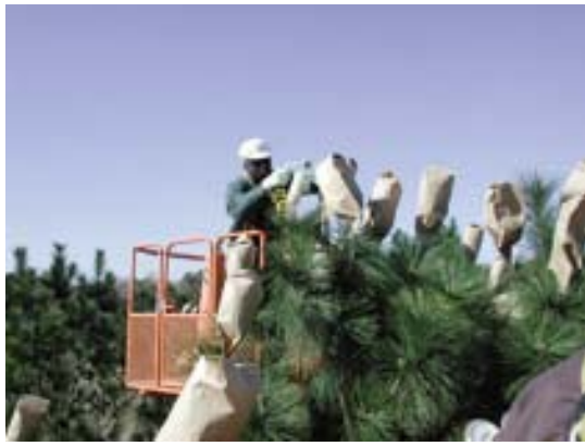
Figure 1. Mass control pollinations taking place in a seed orchard (left). Here a worker applies pollen from a single selection inside the bag to a selected female, making a full-sib cross.