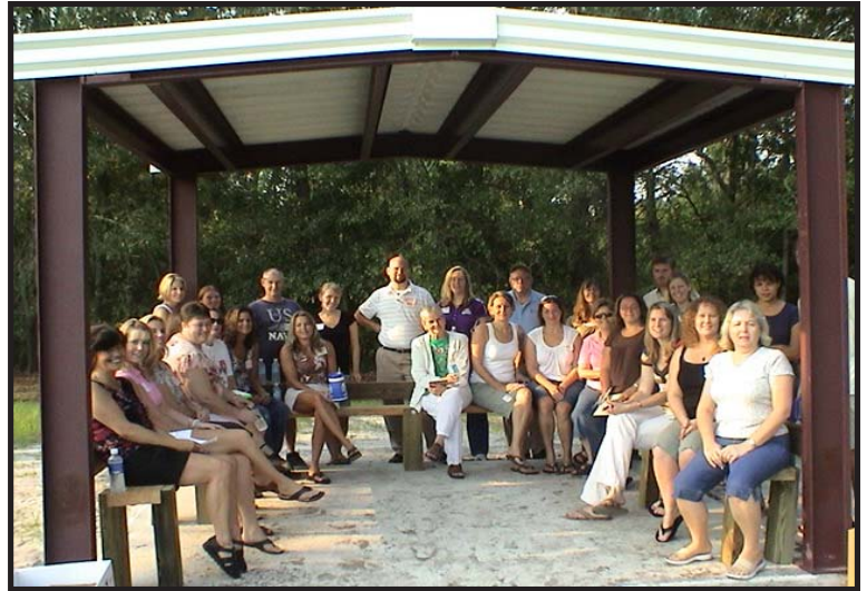
Lake Butler teachers experience the pavilion.

Florida Project Learning Tree also partnered with the School to provide workshops and environmental connections to use in the new classroom. This August, 52 faculty members attended Project Learning Tree Workshops. Teachers were led through a series of grade-appropriate hands-on activities integrating reading, technology, and science. Each day ended with a brainstorming session on how teachers can incorporate activities and the outdoor classroom into their lesson plans for the year.