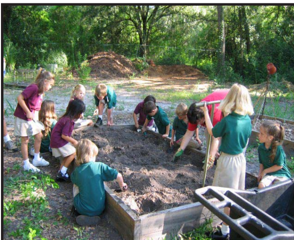
Second graders planting the class pizza garden.