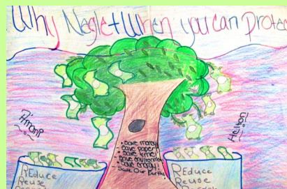
Poster: "Why Neglect When You Can Protect?"