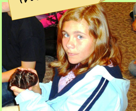
A middle school student learning at a PLT school, Riversink Elementary.