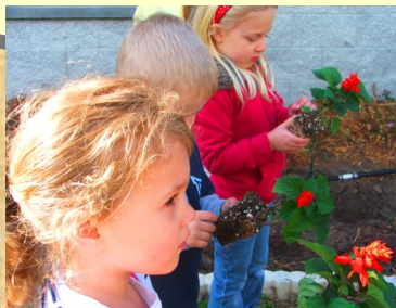
Elementary students at St. Paul Lutheran School, Lakeland FL.

City of Apopka Brevard Zoo Florida Dept. of Environmental Protection Florida Department of Education Florida Division of Forestry Florida Forestry Association International Paper Company Jacksonville Zoo & Gardens Langdale Woodlands National Forests of Florida, USFS Packaging Corp. of America Plum Creek Timber Company St. Johns River Water Management District St. Marks National Wildlife Refuge, US FWS UF/IFAS 4-H Youth Program