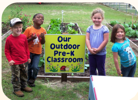
Community Garden at Wakulla Pre-K Learning Center in Crawfordville, FL.