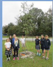
St. Paul Lutheran celebrating Florida Arbor Day

was developed to promote reading to elementary students, helping to provide a greater awareness of the importance of trees.