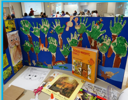
Early childhood activities