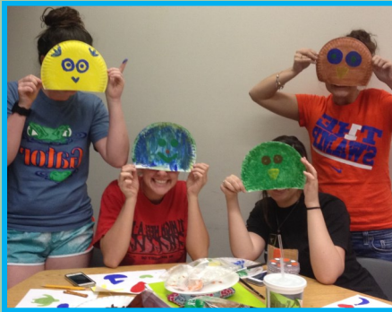
Early childhood participants