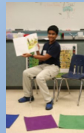
Museum story time at the Children's Science Explorium

was developed to promote reading to elementary students, helping to provide a greater awareness of the importance of trees.